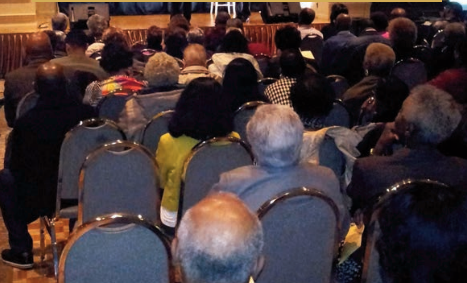
Guyana Cultural Association of New York Inc. on-line Magazine

While discovering the strength of theater as an engine for social change, I also have found something of great personal value. I have rediscovered my own community.